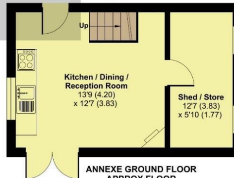
ANNEXE GROUND FLOOR APPROX FLOOR AREA 23.4 SQ M (252 SQ FT)