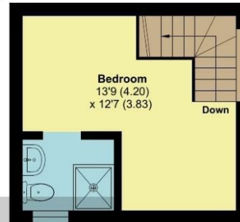
ANNEXE FIRST FLOOR APPROX FLOOR AREA 16 SQ M (173 SQ FT)